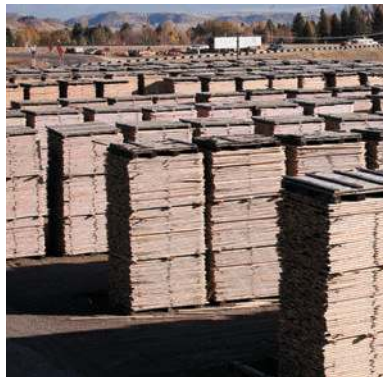
RY Timber in Livingston, Montana